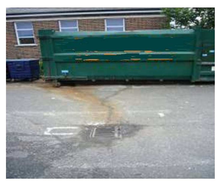
Compactor run-off polluting surface water

Compactor waste runoff may be considered trade effluent and would be controlled by the Sewerage Undertaker by 'Consent to Discharge'. The runoff waste water must be directed to foul sewer, discharges to surface water or storm drains are not acceptable as the waste has the potential to cause environmental pollution and with risk of prosecution.