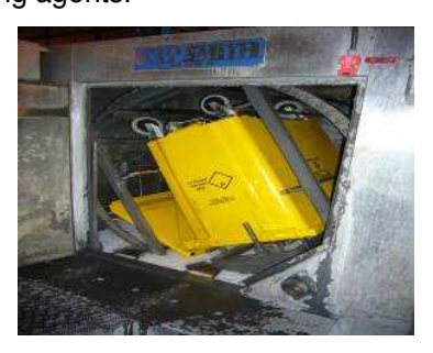
Clinical waste cart bin washing

Some Healthcare organisation and most clinical waste management sites clean clinical waste carts on site for redistribution. Sites either have a bin washer machine or wash them with pressure washers and cleaning agents.