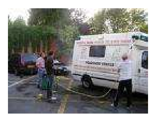
Ambulance being washed and cleaned on a healthcare site

Transportation, such as providing ambulance services, is an essential part of many hospitals activities. Associated with the provision of these services is an ongoing requirement to clean and maintain vehicles. This is often undertaken on the hospital premises and if not properly managed the resultant effluent and run-off from vehicle washing can pollute water courses. Pollutants include dirt, brake dust, traffic film residuals, oils and cleaning agents.