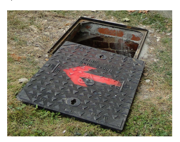
Drain marking – red for foul – on a hospital site.

It is good practice to mark your drainage systems and provide details on up-to-date drainage plans. Red for foul and blue for surface drainage, marking with an arrow in the direction of flow. This information should always be held on site for quick reference as it is extremely useful to the regulatory bodies and Sewerage Undertakers in the event of an on-site incident or spillage and in controlling its escape from site.